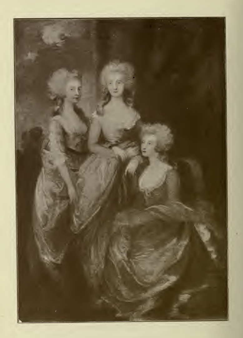
THE ELDER PRINCESSES (1785).