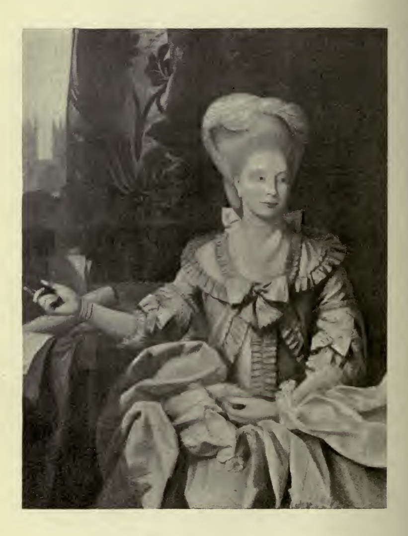
QUEEN CHARLOTTE (From the picture by West)